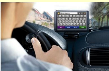
In Cab Messaging