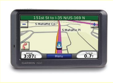
The 265W plus