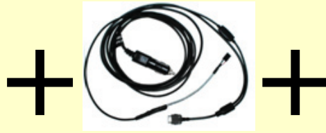
FMI 10 plus